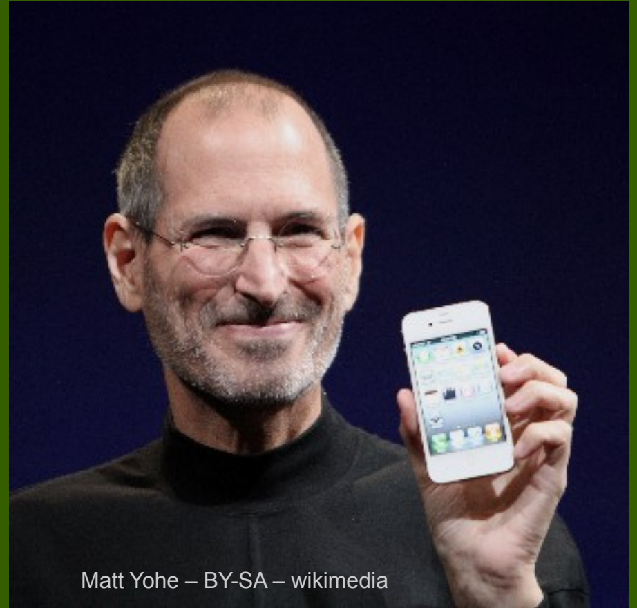
Matt Yohe – BY-SA – wikimedia