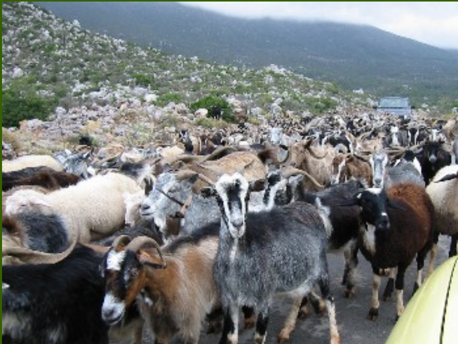
AlMare – public domain – wikimedia